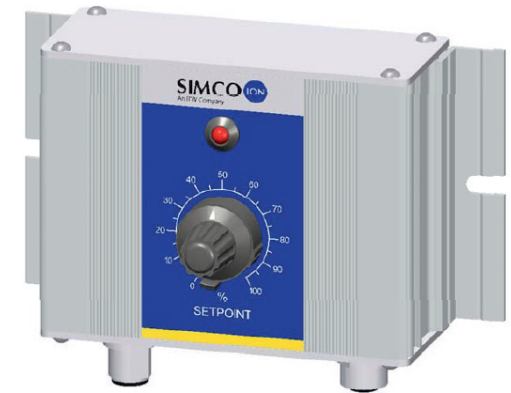
External control unit optional