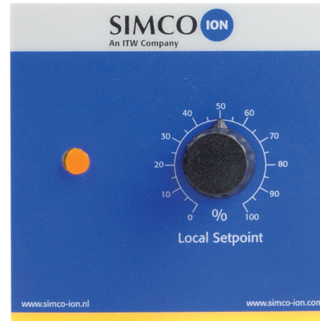
External control kit optional