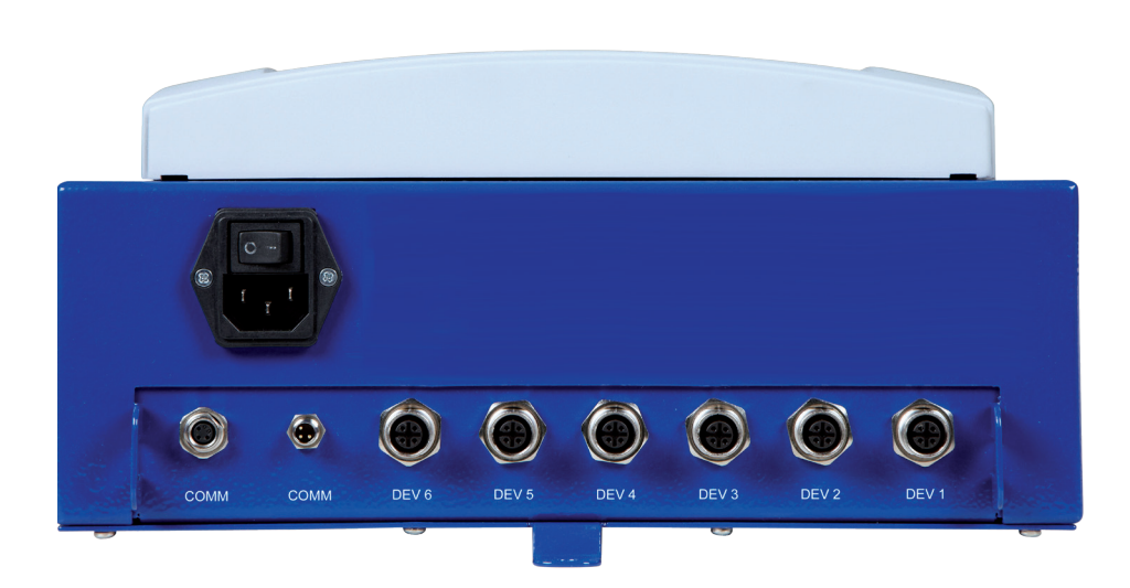
Connection of up to 6 devices