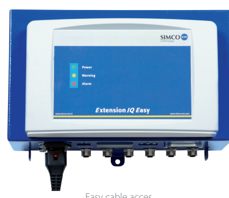
Easy cable acces